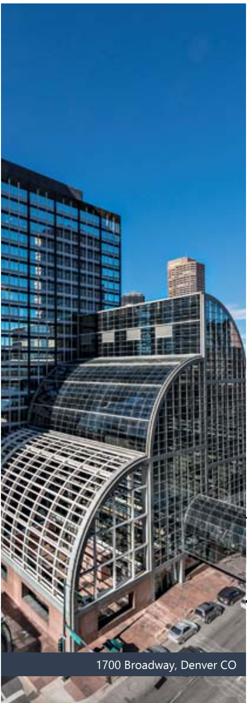
1700 Broadway, Denver CO